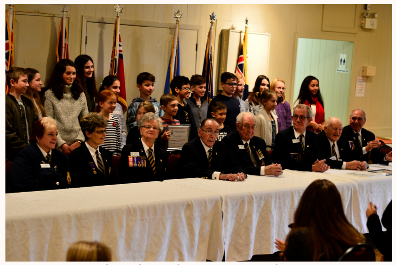
Youth Education Remembrance Poster and Writing Contest Winners with Branch Executive Members